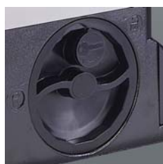
■ Rotating release device easy to operate and key "protected" (standard)